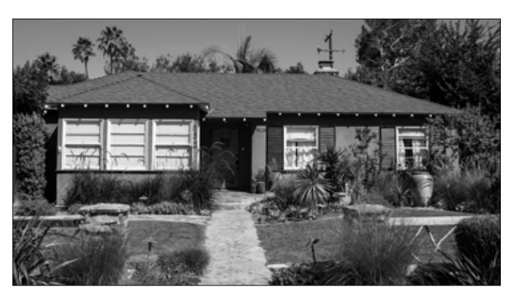
539 W. Valley View Drive

style. When the style began appearing in the 1920s, Minimal Traditional home designs were standardized and published in home pattern books that helped to spread the style across the country. Because the homes were for sale to the general public, the factorybuilt dwellings were designed to appeal to the broadest range of tastes. Variations of the style were used to appeal to many differ-