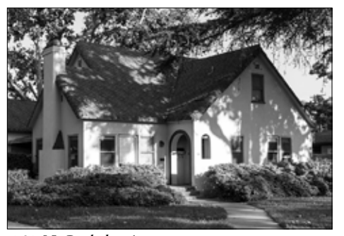
150 N. Berkeley Avenue

FHA Houses could be built in a variety of materials but had to be "attractively designed without excessive ornamentation." Architects were expected to keep home designs simple and useful based upon one guiding principle: "A maximum accommodation within a minimum of means." Basic floor plans consisted of a living room and dining area, kitchen, bath, one to three bedrooms, with or without an attached garage. The FHA booklets called for the uniform standardization of the parts of a house, including plumbing, ceiling heights,