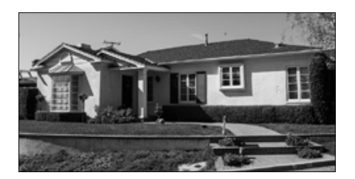
769 Ocean View Drive

The FHA did not care about classical design when it came to new homes. What the FHA wanted was simple, well-constructed homes that achieved maximum square footage for minimum cost. FHA house building requirements limited sales price, in order to